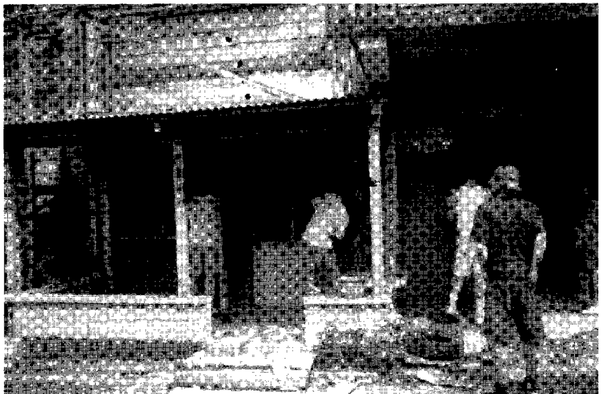
Some of the last work party to O.B.C. working on the college.

"The whole trip was a great success. People here . . . are very grateful"