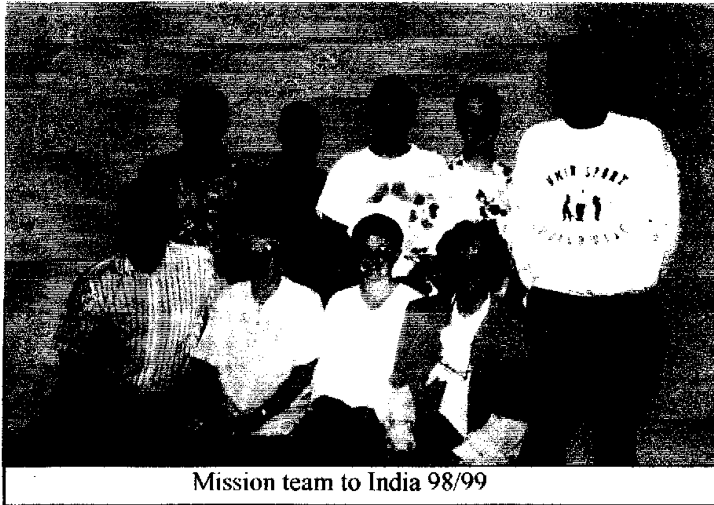
Mission team to India 98/99

...Thank you for continually upholding us in your prayers. Greet all our brethren and friends. May the Good Lord cause His face to shine upon you always!"