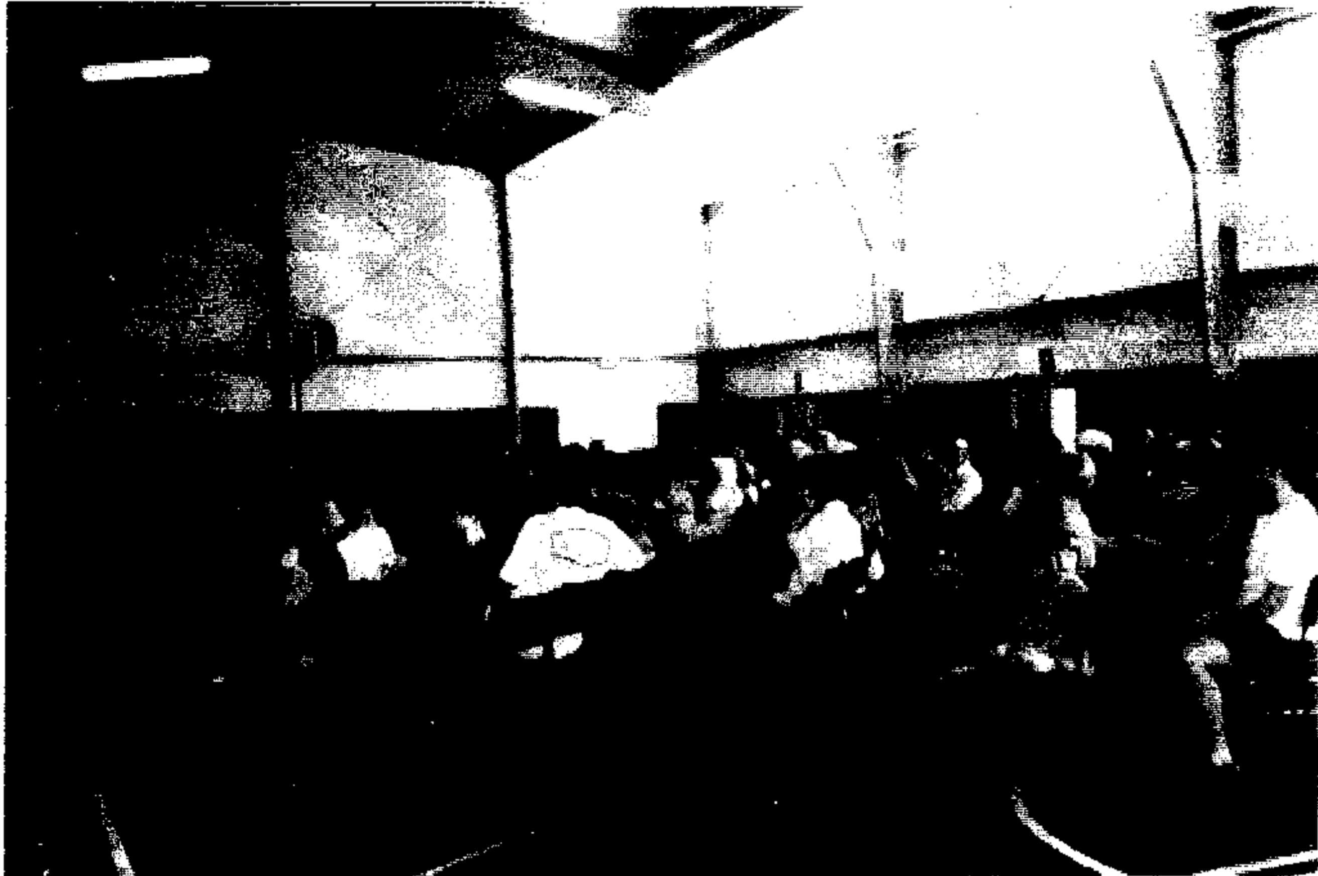
Opening Ceremony for the Re-creation Centre

We have great dreams for next year in terms of further development, ones which we believe will assist us in our ever-developing programme for folk who come